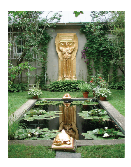
Atrium with Amor Caritas.